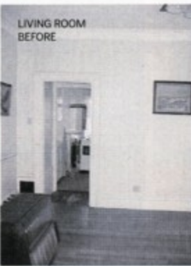
LIVING ROOM BEFORE